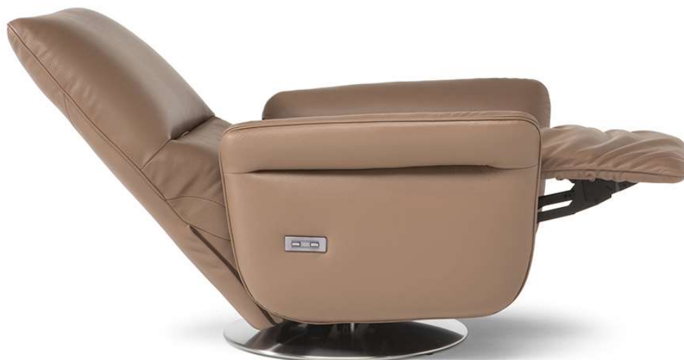
■ Vers. F44