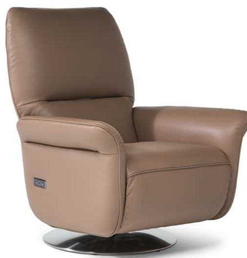
■ Vers. F44