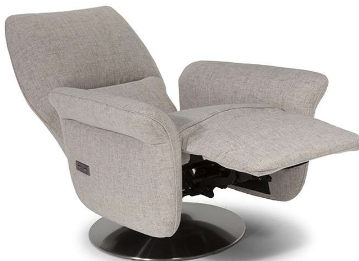
■ Vers. F45